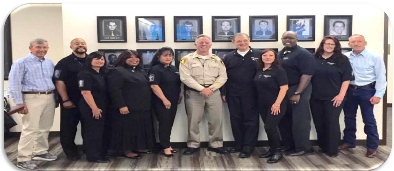
Praying for all people regardless of faith.

MOFM Police Chaplains Are Members of the International Conference of Police Chaplains (ICPC). They seek to maintain professionalism in law enforcement chaplaincy.